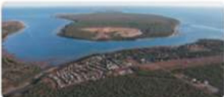
View of Aboriginal Beach showing components of Great Gulf Nature

The Aboriginal Benefits Trust (ABT) transitions to a new modern structure, the Gulf Regional Economic Aboriginal Trust (GREAT)