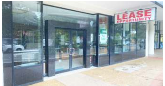
Image above. $500k in grant funding was sought with ADBT contributing an additional $250k towards the purchase/project.

The Business Advisor submitted an application for expansion of Ancient Journeys shop by purchasing the shop next door.