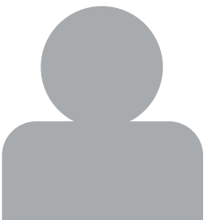
Vacant GREAT Director Doomadgee Council Representative