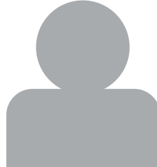
Vacant GREAT Director Yangkaal representative from Gulf Region Aboriginal Corporation RNTBC