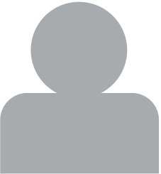
Vacant GREAT Director Representative for Kukatj PBC