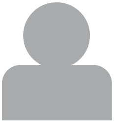
Vacant ADBT Director Representative for Waanyi Native Title Group.