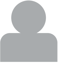
Vacant GREAT/ADBT Director Finance