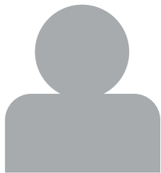
Vacant ADBT Director Najabarra, Doomadgee, Gregory or Burketown Community Representative.